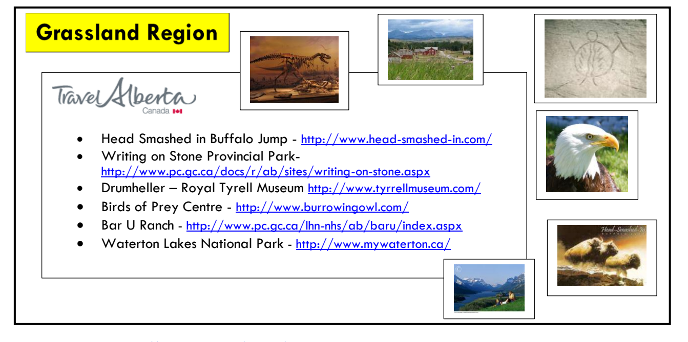
IMAGE SOURCE PAGE: http://www.wingrider.net/Canada/Pagep54.htm IMAGE SOURCE PAGE: http://www.tripadvisor.ca/Attraction_Review-g815290-d536 IMAGE SOURCE PAGE: http://www.absoluteastronomy.com/topics/Writing-on-Stone IMAGE SOURCE PAGE: http://canadabadlands.com/2010/02/highlights-of-our-can IMAGE SOURCE PAGE: http://www.visualphotos.com/image/1x5601435/waterton_ IMAGE SOURCE PAGE: http://photobucket.com/images/Smashed+head/

IMAGE SOURCE PAGE: http://www.irrigationsaskat chewan.com/ICDC/forage.h tm