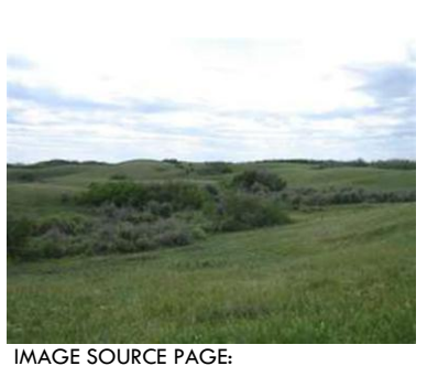
IMAGE SOURCE PAGE: http://www.ualberta.ca/~anaeth/research team.html

PAGE: http://albertawilderness.ca/issues/wildlands/milk _river-ridge